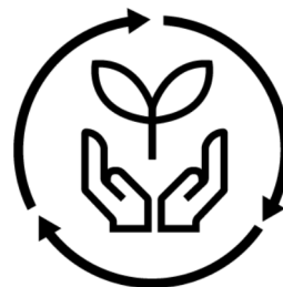
Sustainability & Circularity