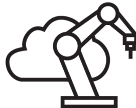
Automation & Digital Future